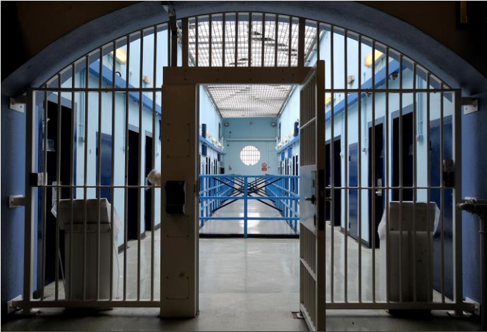
RTE News piece regarding J-ARC Evaluation

measured in the future, the current state of play with JARC implementation, and further plans and prospects for JARC in the future.