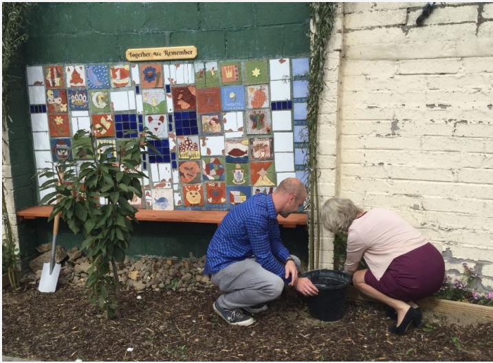
Pictured: Tree Planting at opening of Memorial Garden

Tower offers a number of initiatives including a Day Programme that provides training and education to Probation Service clients. The Dublin & Dun Laoghaire Education Training Board presented participants from the programme with certificates to mark the completion of their Quality and Qualifications Ireland (QQI) accredited courses.